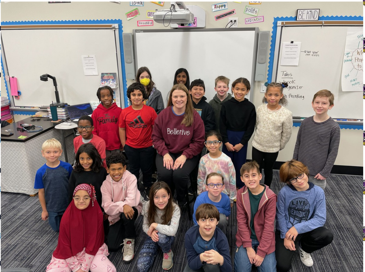
Parkway Alumni Named Teacher of the Year at Bellerive Elementary